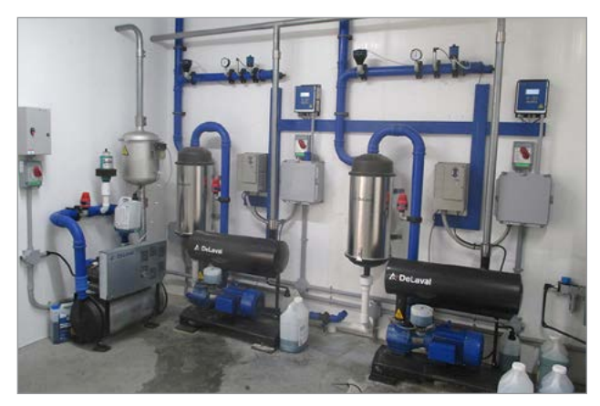
Figure 1. Equipment room free of clutter, dust and debris.