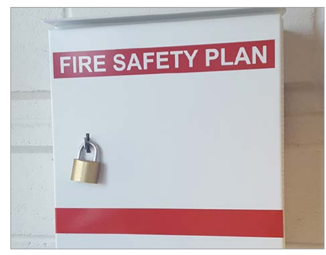
Figure 6. Fire safety plan stored on site.