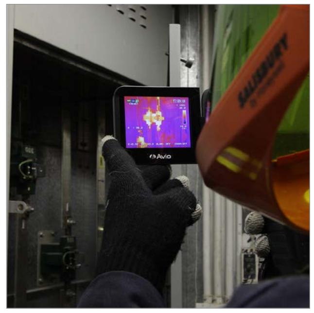
Figure 5. Inspection of electrical equipment by insurance company.