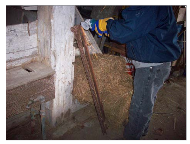
Figure 4. Grinding a piece of steel in close proximity to combustible materials.