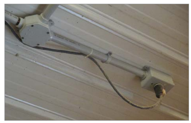
Figure 2. Temporary electrical equipment plugged into receptacle in livestock area.