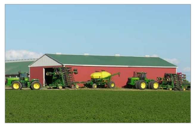
Figure 9. Equipment stored away from livestock housing.