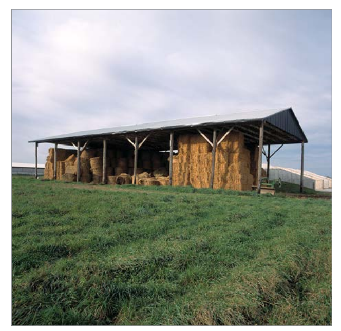
Figure 10. Separate storage building for hay and bedding.