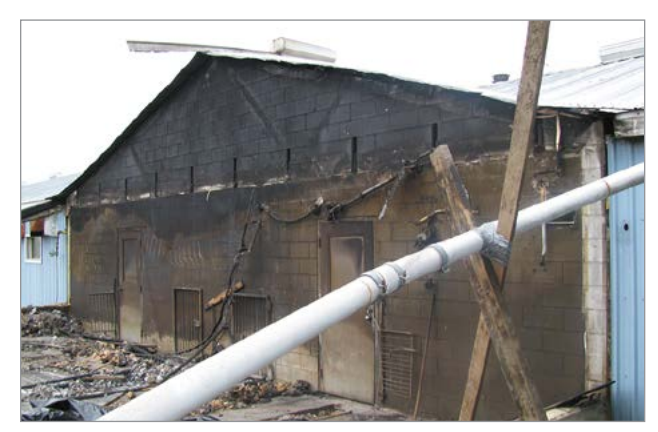
Figure 7. Example of an intact fire separation that did its job and prevented fire from spreading through the barn.