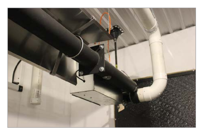
Figure 8. Radiant tube heater suspended in barn.