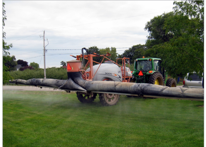
Figure 9. Air-assist sleeve on a horizontal boom.