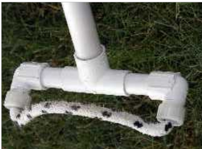
Figure 11. Rope-style wiper/wick system.