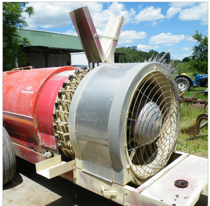
Figure 3. Airblast sprayer with deflectors.