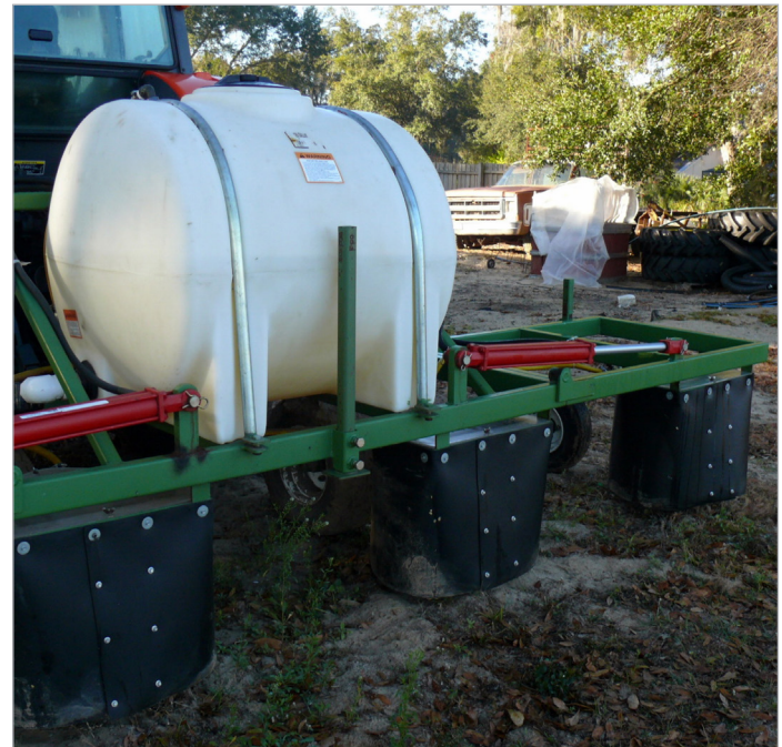
Figure 10. Shrouds on a horizontal boom.