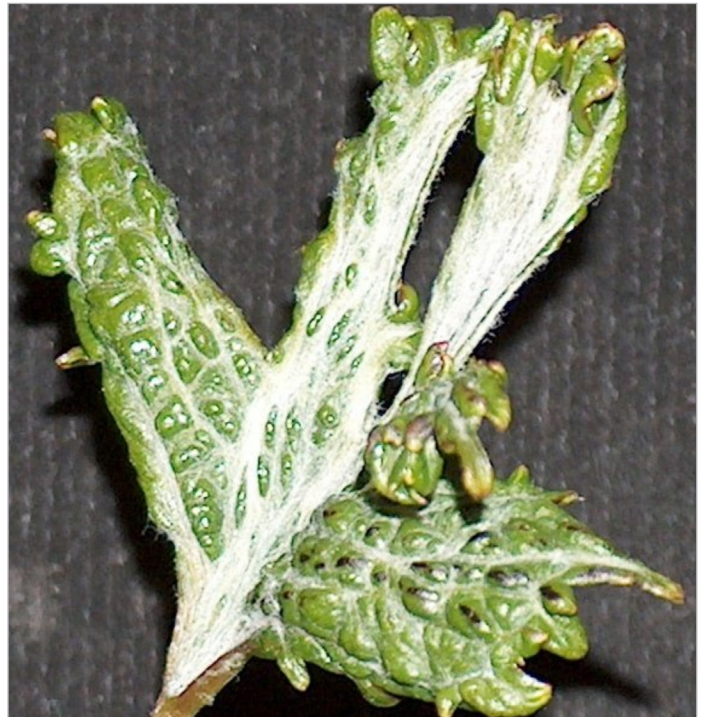
Figure 1. 2,4-D drift damage on grape leaves.

There are also legal responsibilities and liabilities associated with all these issues.