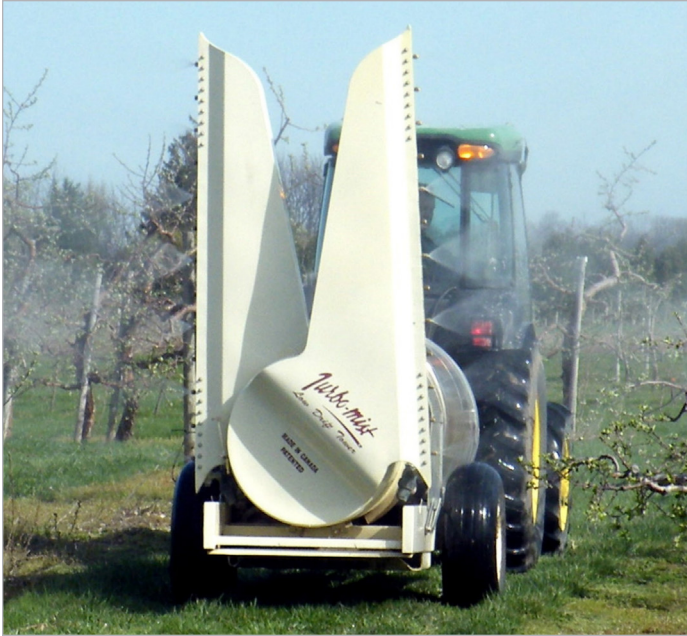
Figure 4. Airblast sprayer with towers.