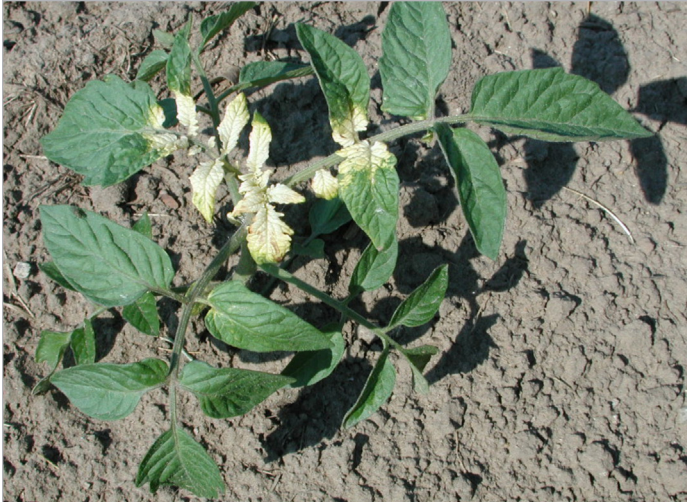
Figure 2. Glyphosate drift damage on a tomato plant.

All spray operators must be concerned about pesticide drift and make efforts to mitigate drift in all forms. While some level of drift may occur during or after an application, understanding the factors that affect it can minimize its effects.