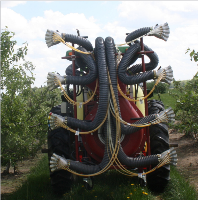
Figure 7. Laser-scanning sensor-controlled air assisted sprayer.