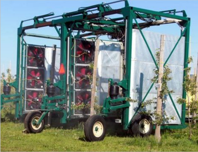
Figure 6. Recycling sprayer.