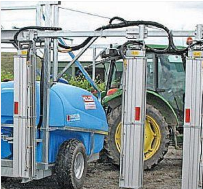
Figure 5. Tangential sprayer.