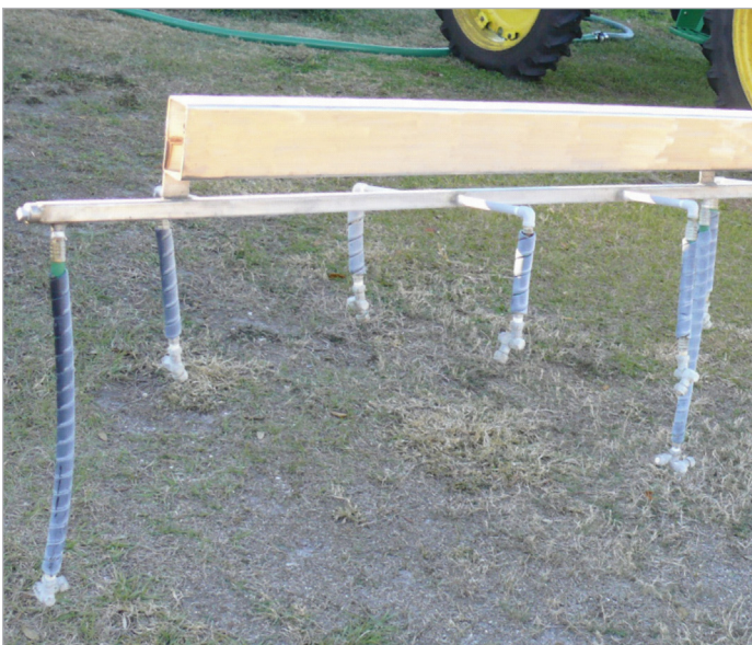
Figure 8. Drop-arms on a horizontal boom.