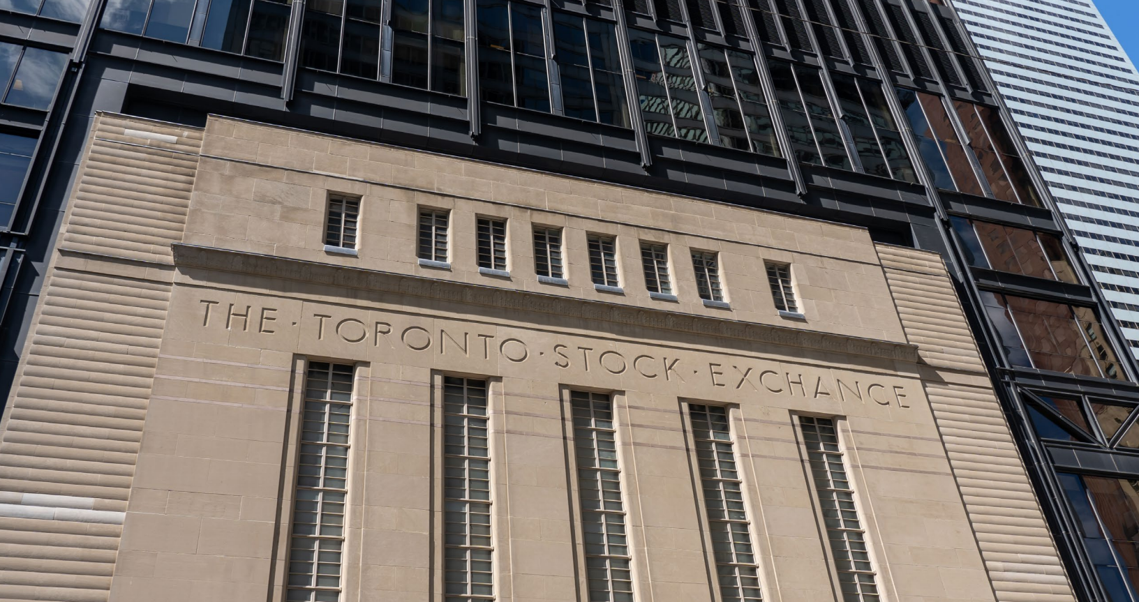
Above: The Toronto Stock Exchange