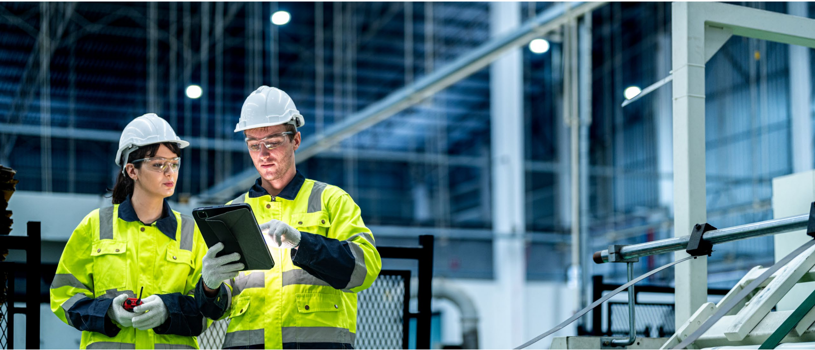
Below: Engineers at a technology production facility

Canada's successful bid is a result of our national network of centres of excellence. The DSRB has the potential to be a long-term economic and institutional anchor for Ontario and Canada, support thousands of high-value jobs and place the province at the centre of a new architecture of defence, security and resilience finance. Toronto provides the most robust and internationally credible headquarters platform and is Canada's best option for delivering on the bank's ambitious mandate. Ontario is prepared to support the bank in finding office space in Toronto to accommodate its initial staff and will work with partners to secure a permanent home in the city's financial district.